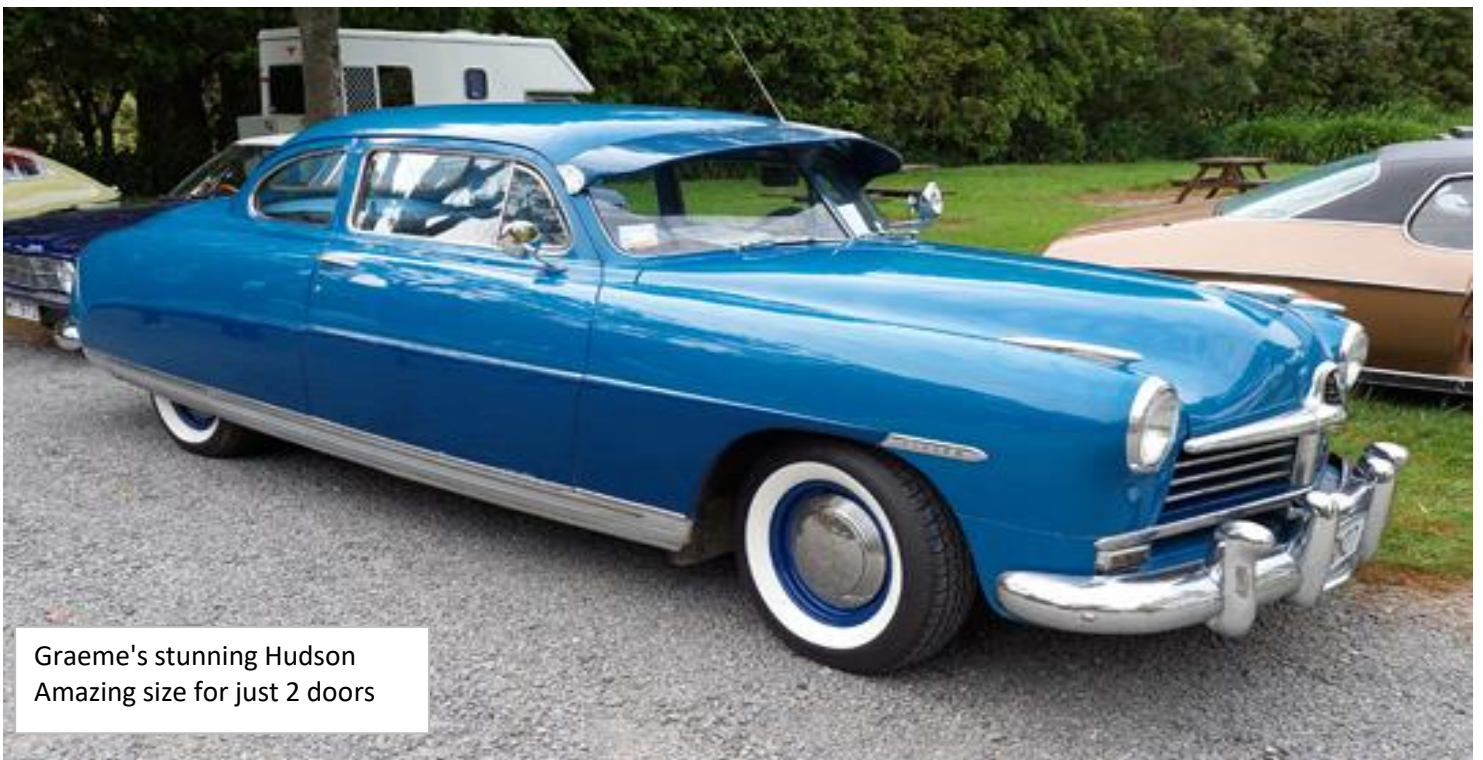
Graeme's stunning Hudson Amazing size for just 2 doors