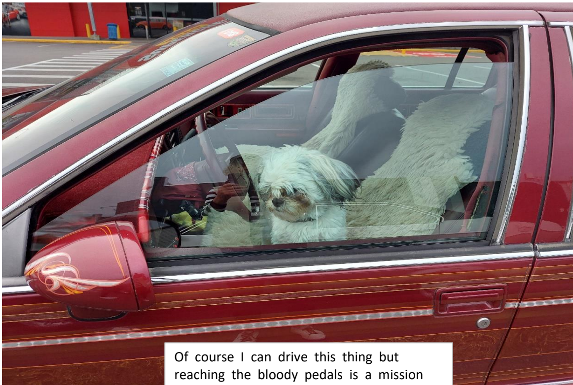
Of course I can drive this thing but reaching the bloody pedals is a mission