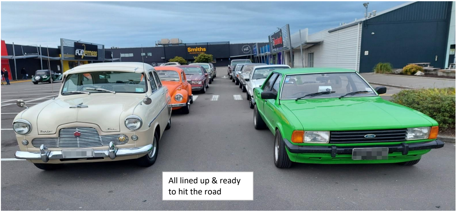
All lined up & ready to hit the road