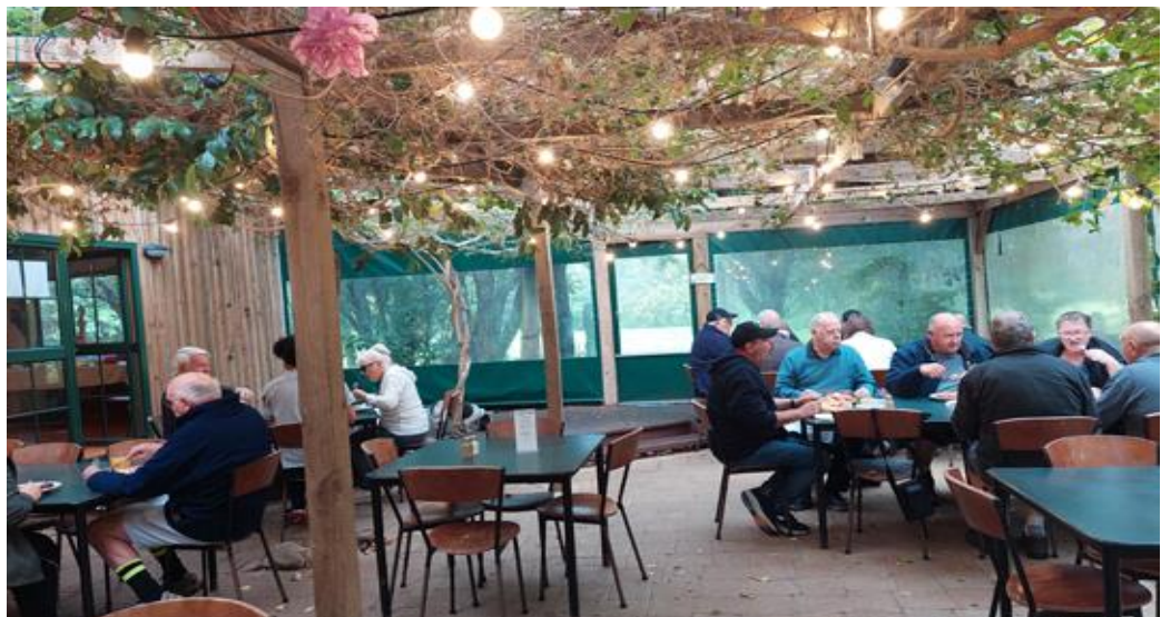
Breakfast under a canopy of Bougainvillea