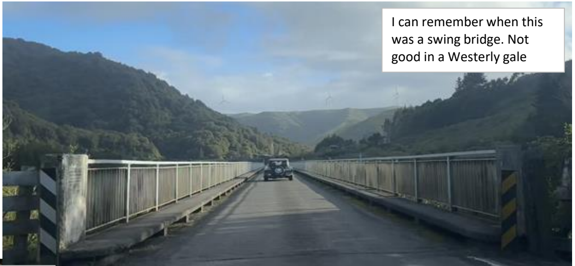
I can remember when this was a swing bridge. Not good in a Westerly gale