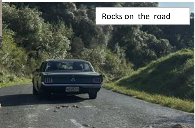
Rocks on the road