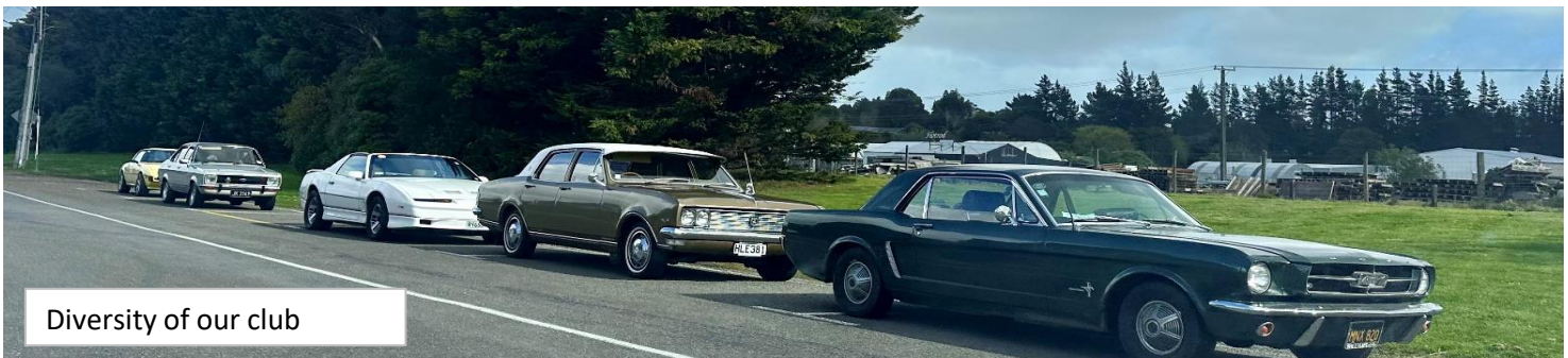
Diversity of our club