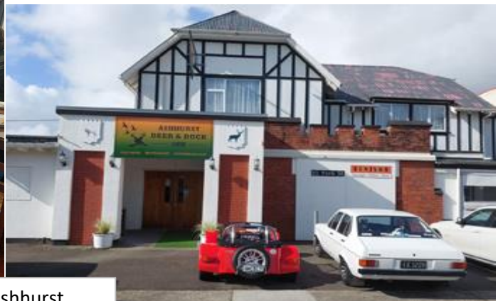
Breakfast at Ashhurst