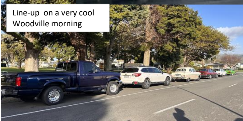
Line-up on a very cool Woodville morning