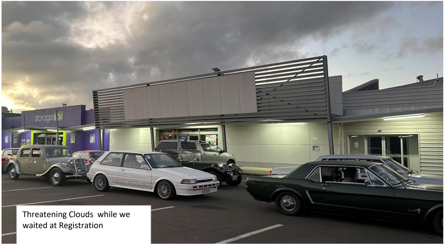
Threatening Clouds while we waited at Registration