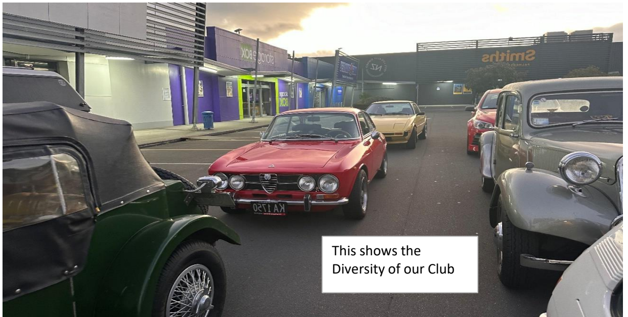
This shows the Diversity of our Club