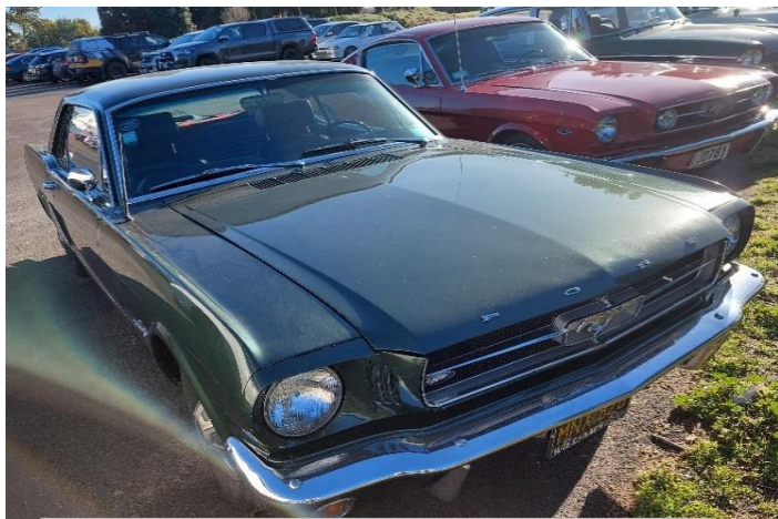
2 Pony cars at Breakfast