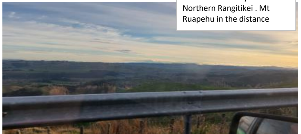
View from Stormy Point of Northern Rangitikei . Mt Ruapehu in the distance