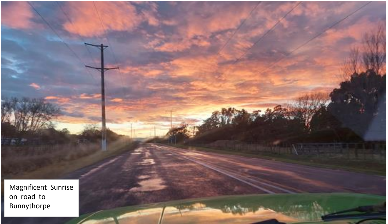
Magnificent Sunrise on road to Bunnythorpe