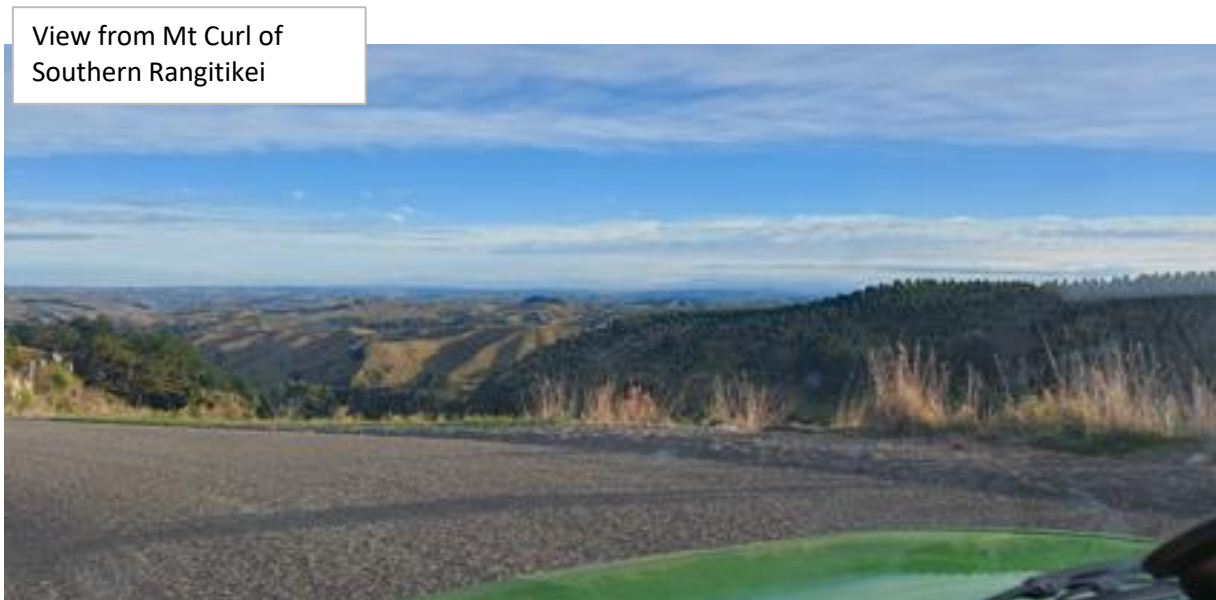
View from Mt Curl of Southern Rangitikei